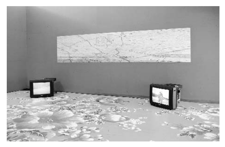
YOU ARE HERE (R.M.), meets TAMAR SITE (M.L.), 2000, Hong Kong

their ornamentality, recalling Markowitsch's Flower Piece . Flower Piece I (1994), a sequence of tall format photographs sandwiched between acrylic glass, shows superimposed layers of magnificent floral arrangements whose opulent, excessive, artificial play of forms and colours rubs shoulders with kitsch. In reference to Michael Lin's patterned landscapes, "Made in Taiwan", Hou Hanru speaks of the transformation of the "connotation of 'kitsch' that has been historically imposed on them. ... It is by no means that kind of tension that an exotic object may cause in contrast to Western norms of perception. Instead, it implies a clear attitude of resistance against the hegemonic 'aesthetic' criteria and the values that they embody."<sup>20</sup>