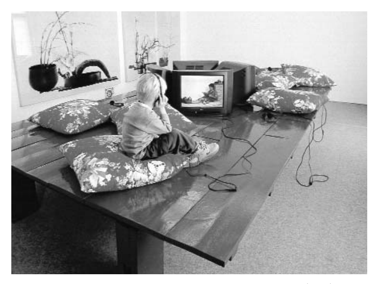
LESEN ZU HAUSE, 2001, Bibliotherapy, Villa Merkel, Esslingen