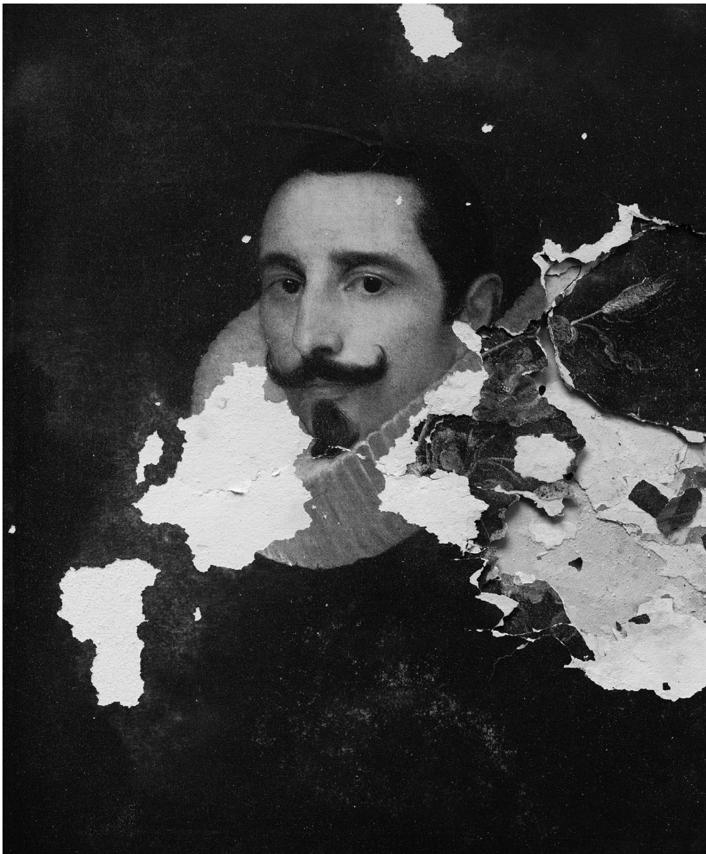
Series: Schadenfreude , 2009 Titel: Van Dyck - Van Kessel Rémy Markowitsch Baryte paper, wood, glass Size: (H) 120 x 97 cm