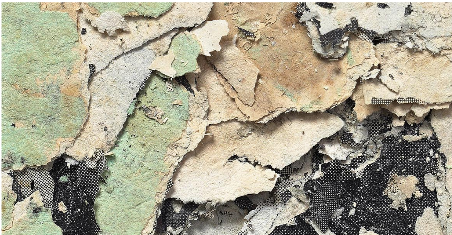
Abraham (Detail), 2009