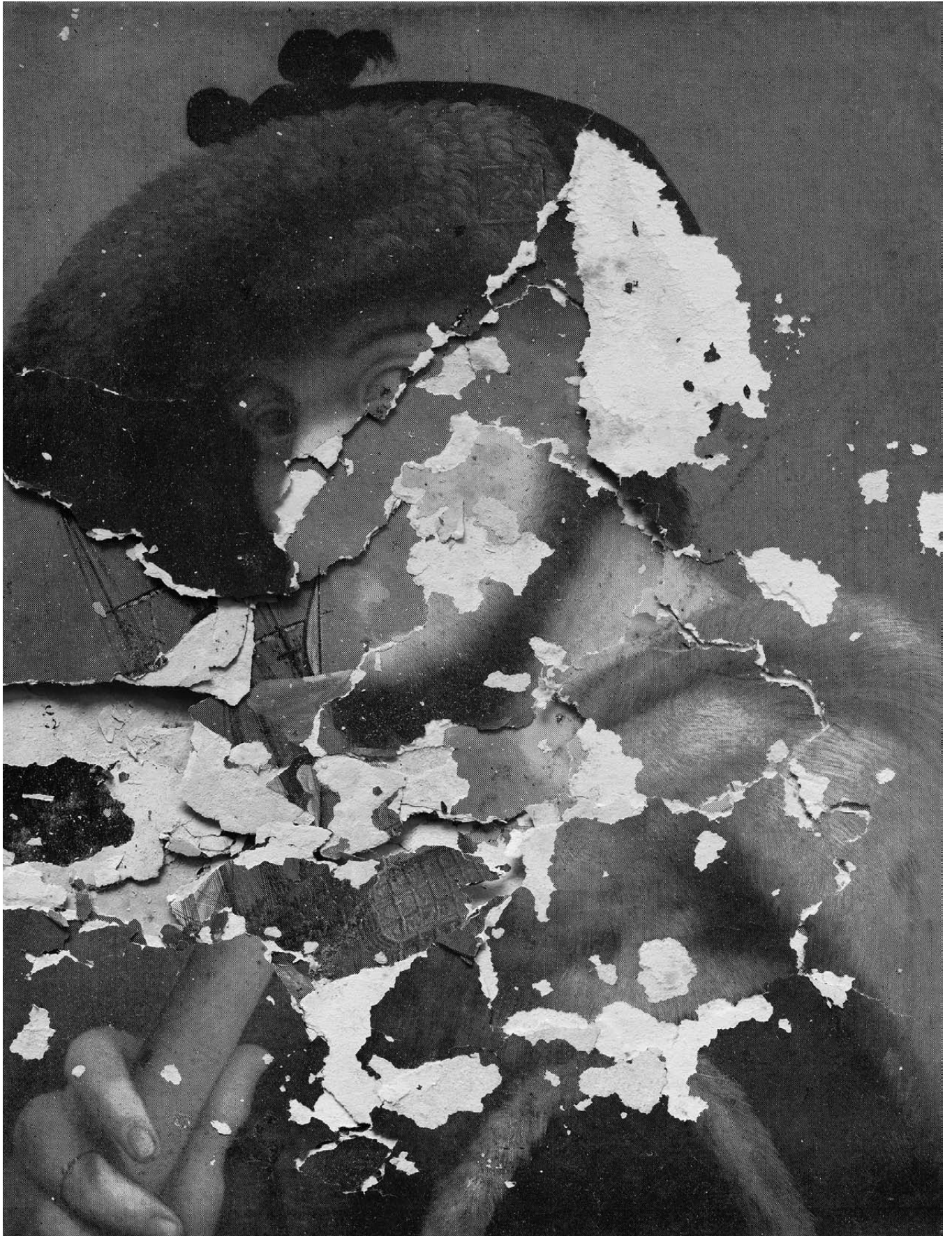
Series: Schadenfreude , 2009 Titel: Caracci - Van de Velde Rémy Markowitsch Baryte paper, wood, glass Size: (B) 120 x 91,5 cm