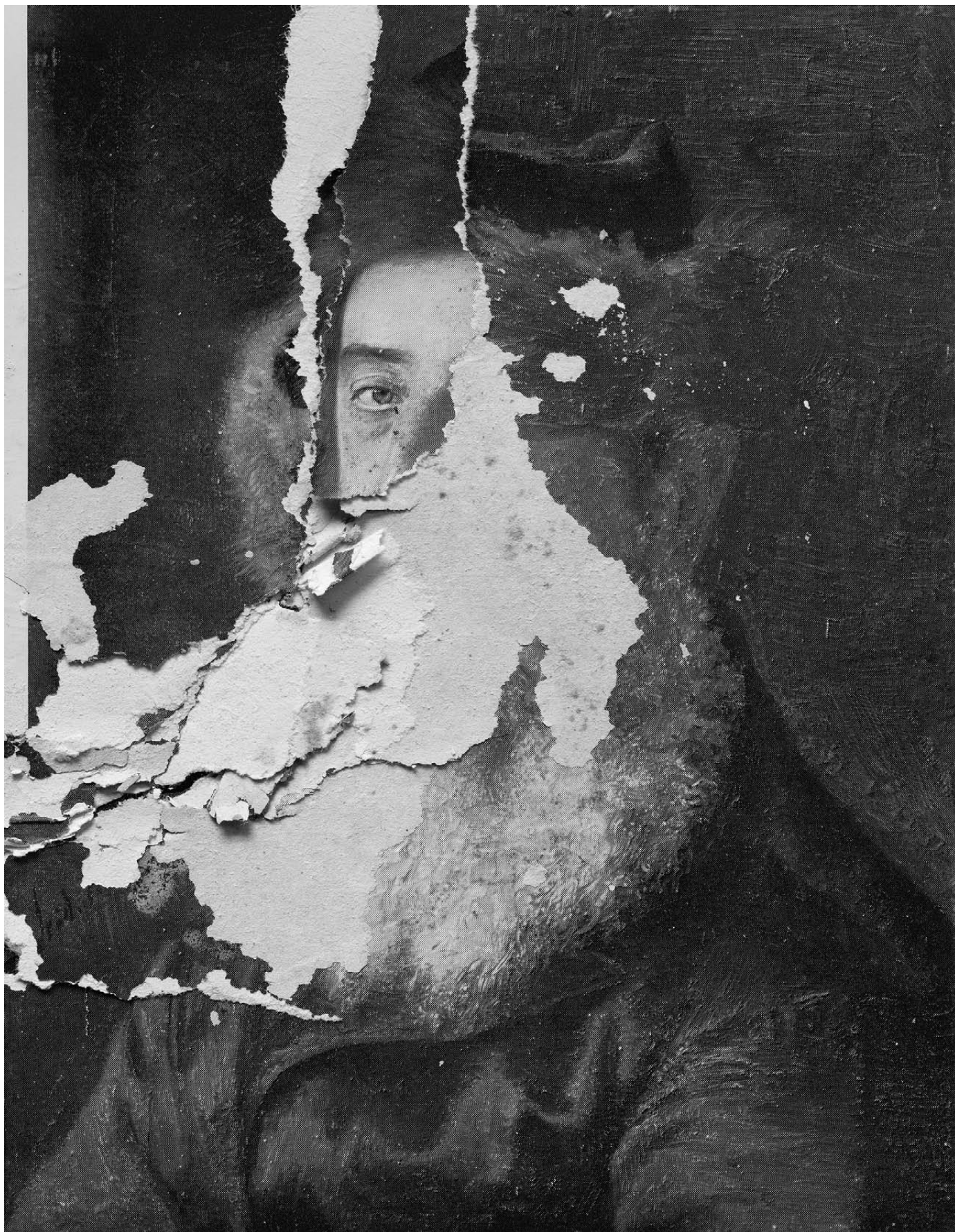
Series: Schadenfreude, 2009 Titel: Kaufmann - Kaufmann - Kaufmann Rémy Markowitsch Baryte paper, wood, glass Size: (H) 120 x 93 cm